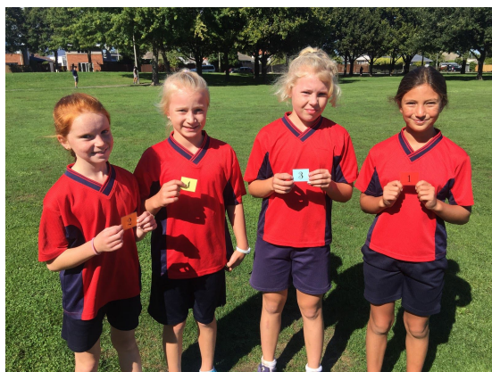
Year 6 Girls