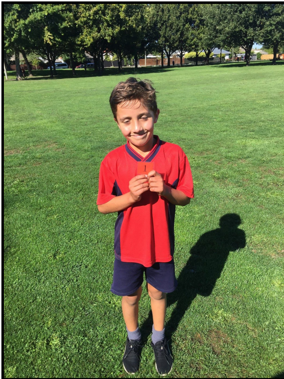
First - Year 5 Boys