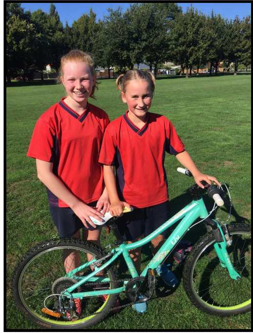
Fourth Place - Open Team Event