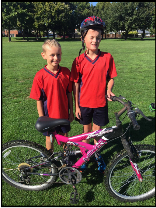
Third Place - Open Team Event