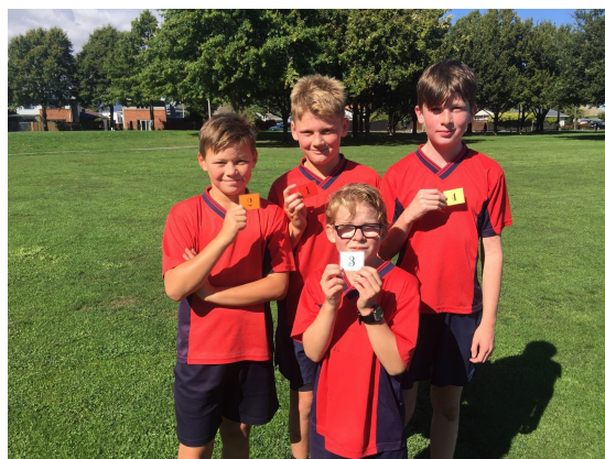
Year 6 Boys

CHOOSING TO BE AN INNOVATIVE CATHOLIC LEARNING COMMUNITY THAT INSPIRES AND EMPOWERS LEARNERS TO SUCCEED.