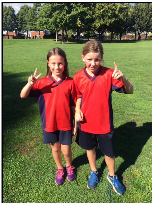
First and Second Year 5 Girls