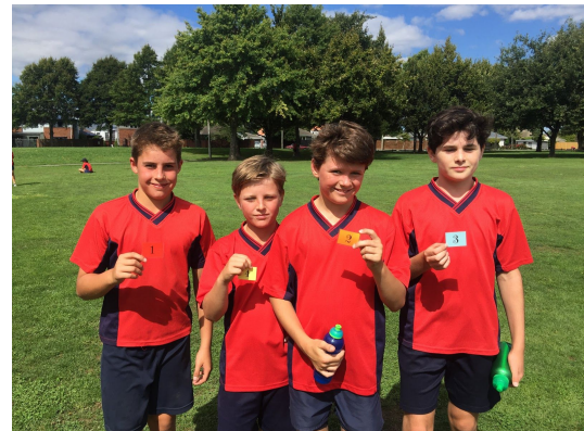
Year 8 Boys