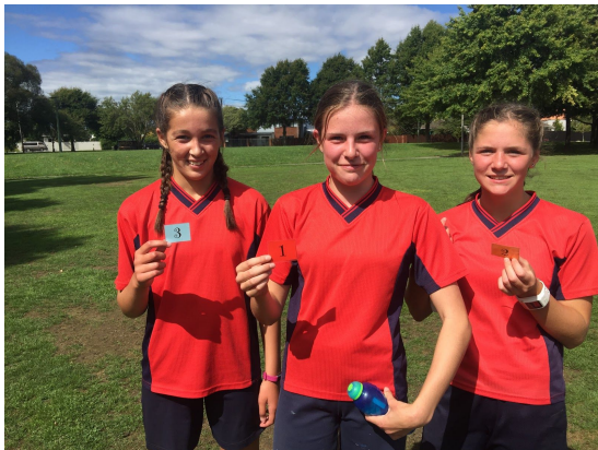
Year 8 Girls