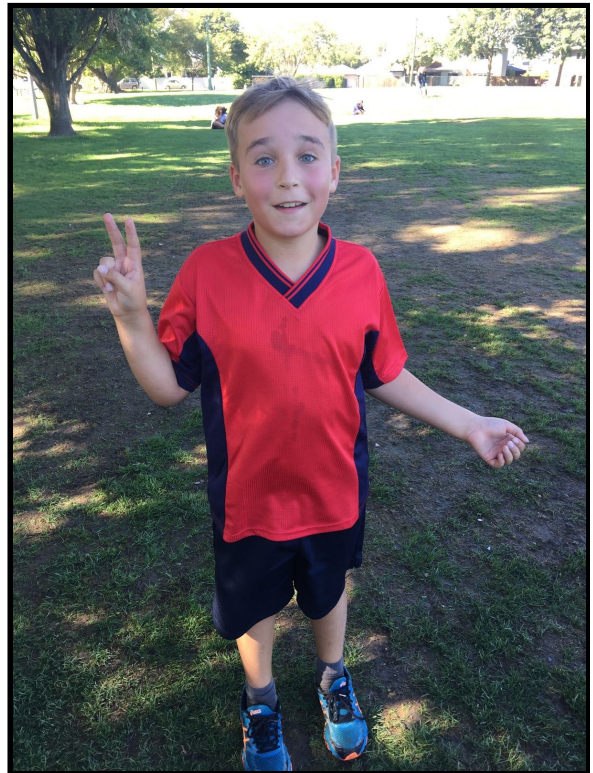
Second - Year 5 Boys

CHOOSING TO BE AN INNOVATIVE CATHOLIC LEARNING COMMUNITY THAT INSPIRES AND EMPOWERS LEARNERS TO SUCCEED.