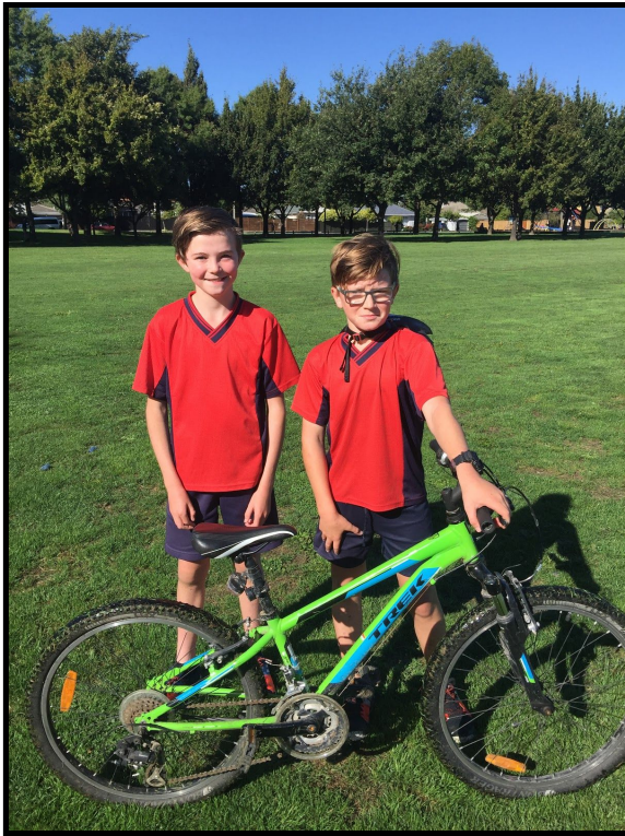
First Place - Open Team Event