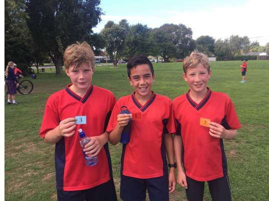
Year 7 Boys