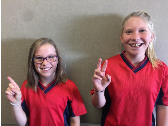
Year 7 Girls