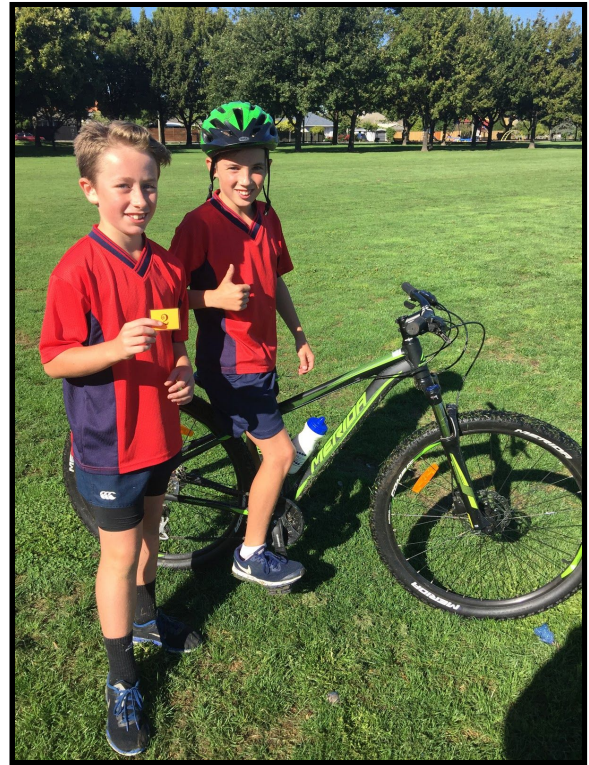
Second Place - Open Team Event

CHOOSING TO BE AN INNOVATIVE CATHOLIC LEARNING COMMUNITY THAT INSPIRES AND EMPOWERS LEARNERS TO SUCCEED.